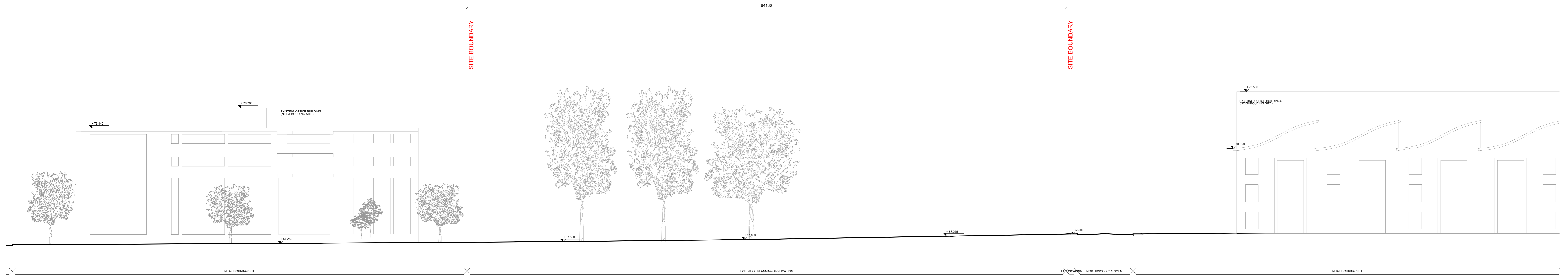
1 EXISTING SITE ELEVATION - WEST 1002 1:200 @A0