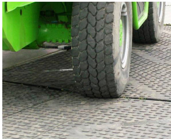
Image 2. Rola-Trac tm protective matting.

Protective matting such as Rola-Trac tm (image 2) should be placed over the initial work zone areas near tree root systems to mitigate any adverse effects from the presence of machinery and associated construction activity by works personnel. These also have the benefit of protecting the soil from any potential works contaminants due to works.